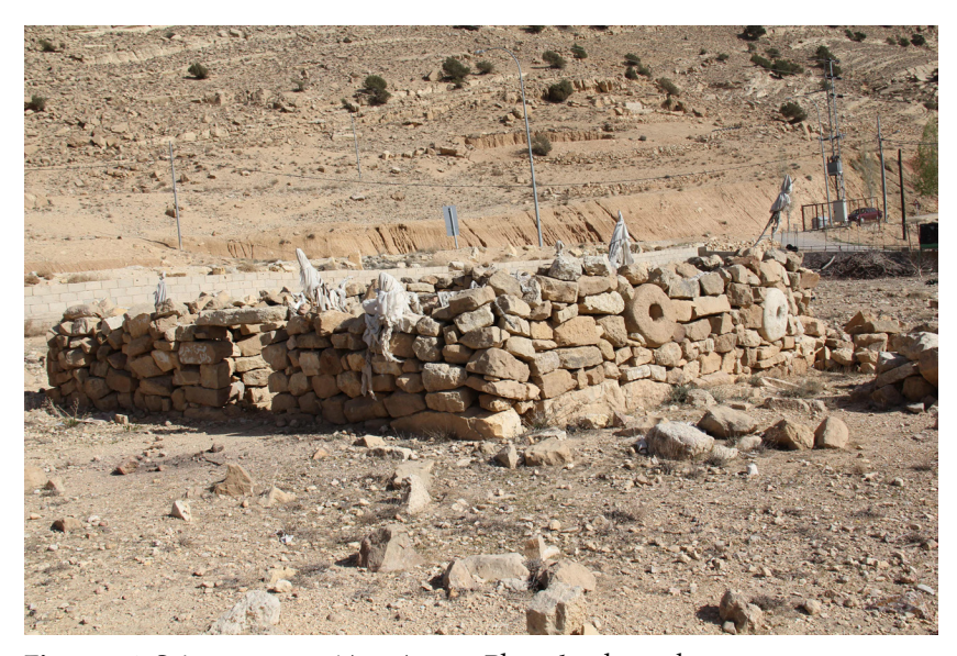
Figure 0.1. Saint graves at 'Ayn Amūn.