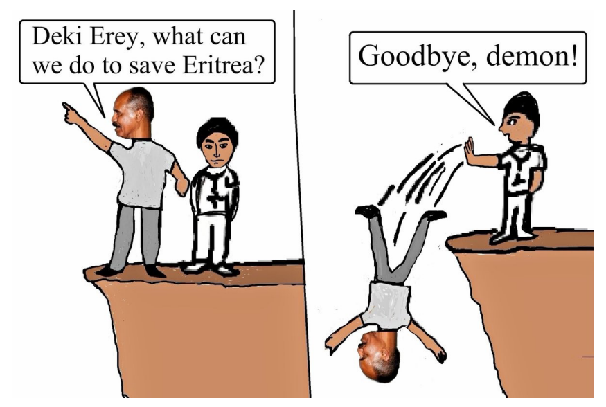
Figure 7.2. Eritrean political cartoon from public Internet sources.

While Isaias conflates patriotism with loyalty to his regime, this cartoon upends that assumption.