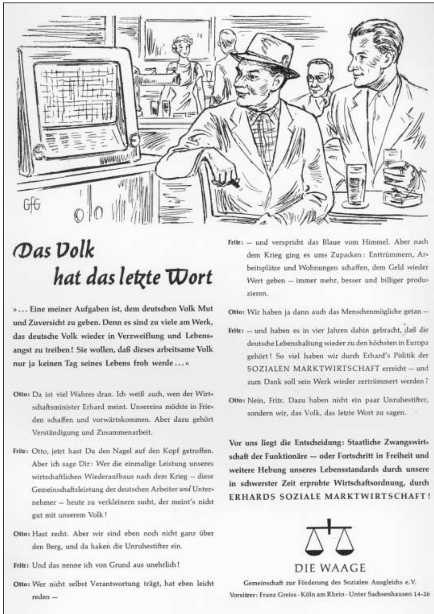
Illustration 5.8 The people have the last word

ing a clear message: they were beyond ideology and concerned only with concrete results.