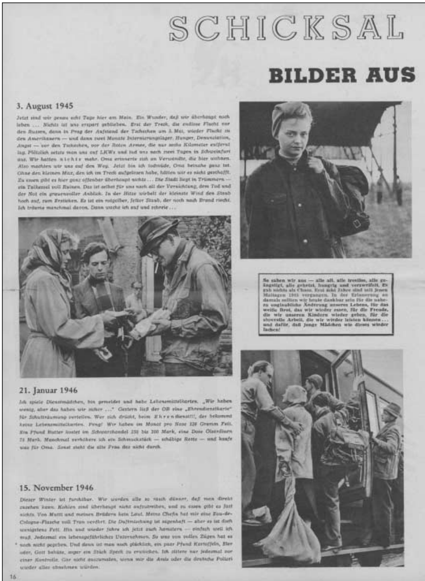
Illustration 5.1 Snapshots out of a German diary (a)

and a pair of stylish ( todschicke ) shoes from a store with so wide a selection that it was hard to decide which pair to buy . In the last entry, dated 7 June 1953, the narrator was even planning a long vacation and trying to stick to her plan of reading a book a week. But it had been difficult to select the books “[s]ince the selection is enormous—and there is so much that one simply must have.” The lesson