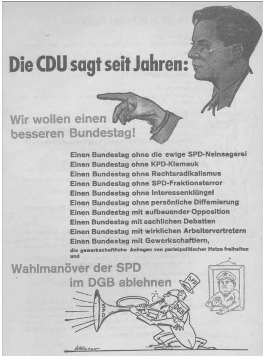
Illustration 5.4 The CDU has said for years:

prices, and what it claimed was the government's inadequate social policy. Just before the election the organization placed an ad in newspapers playing off Die Waage's advertisements in which two workers concluded they would vote for a better Bundestag. The CDU/CSU leaflet exploited the DGB's call to "Vote for a better Bundestag" with a list of accusations against the DGB and the SPD. Beneath the text, a drawing depicted Olenhauer and a DGB representative blowing