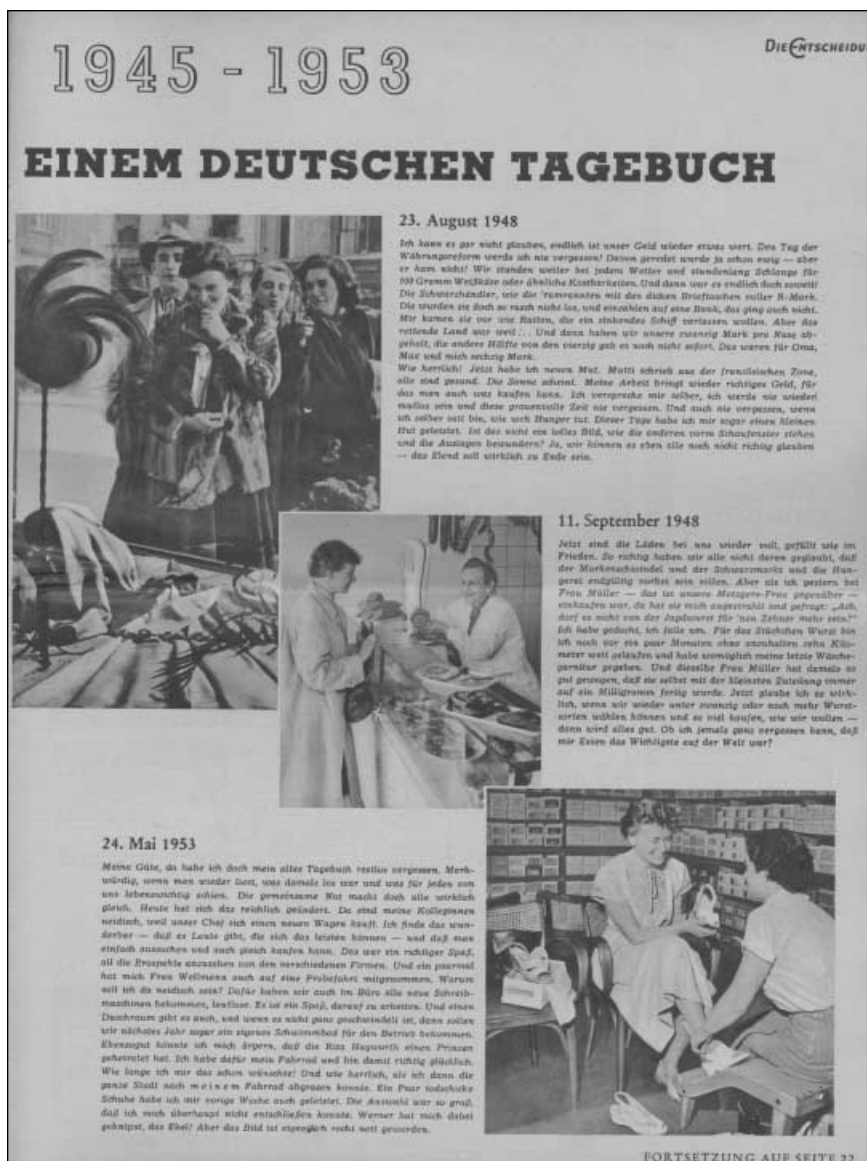
Illustration 5.2 Snapshots out of a German diary (b)

of the whole article was clear: West German living conditions had improved incredibly in the last eight years and ensured the end of the deprivations of the postwar years. Both this individual woman's and West Germany's prospects had been dramatically transformed. To continue this upward trajectory West Germans must vote CDU/CSU.