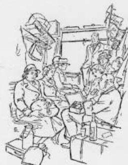
Illustration 5.9 We women have forgotten nothing, and furthermore have learned a thing or two

Köln am Rhein - Unter Sachsenhausen 14-26