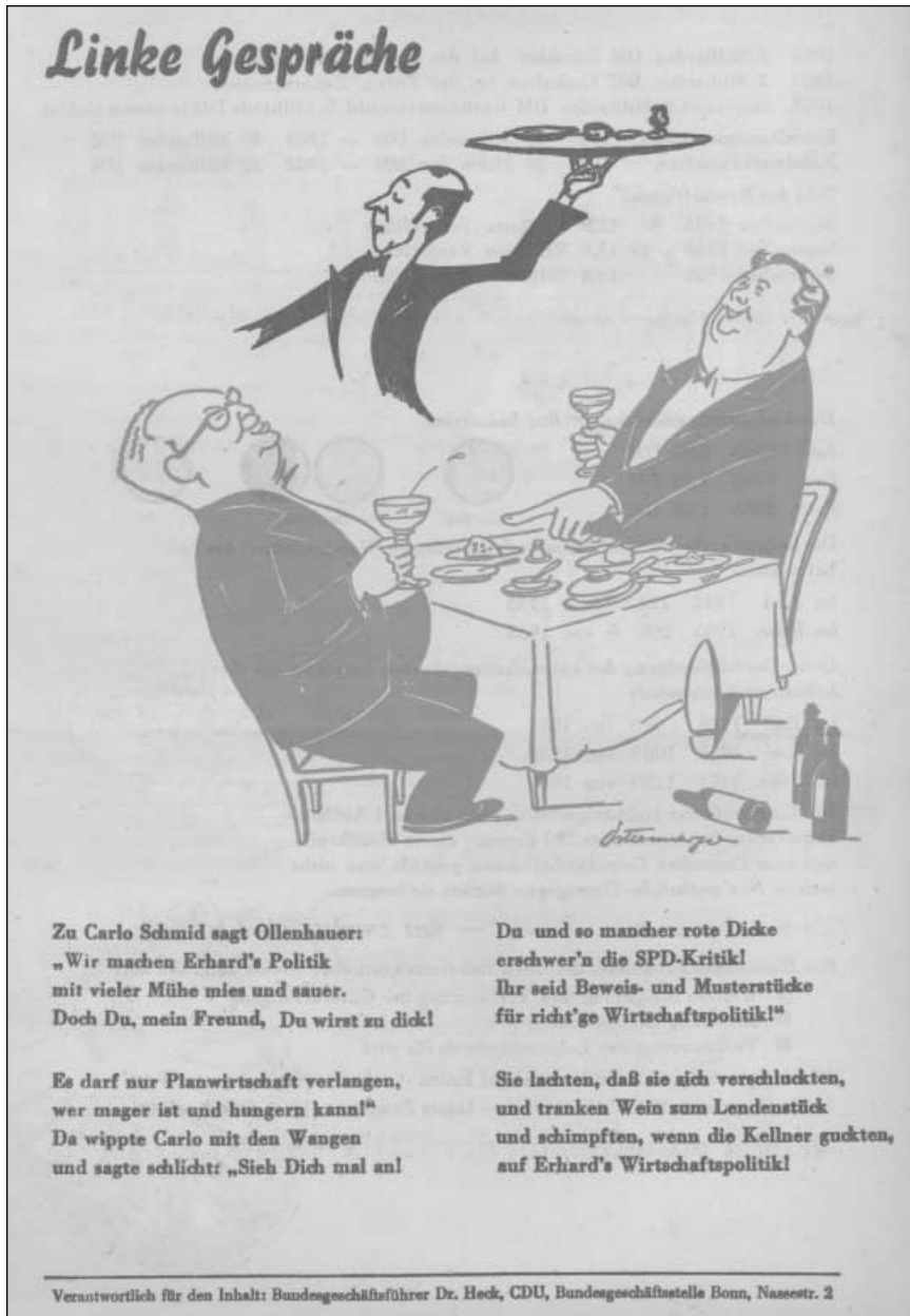
Illustration 5.5 Conversations on the left

sumer, Ludwig Erhard took center stage in marketing this ideology to West Germans—particularly to women voters. A year prior to the election, in a 28 June 1952 speech opening the exhibition of “Die Wirtschaft im Dienst der Hausfrau” (The Economy in Service of the Housewife), in Frankfurt, Erhard clearly articulated