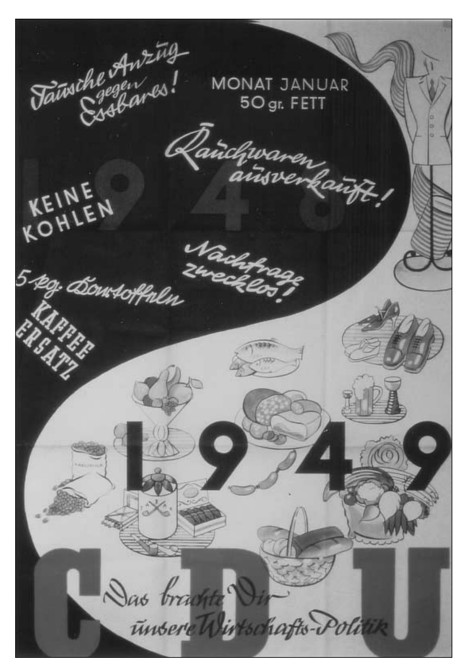
Illustration 2.2 This is what our economic policy provides you