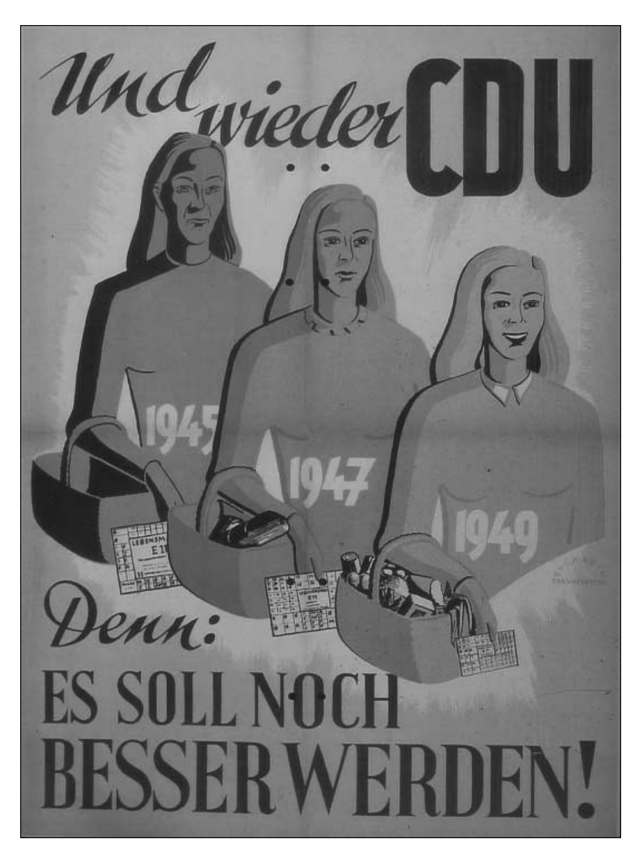
Illustration 2.5 It should get even better!

task of meeting basic needs but also jobbed her of her sexual appeal. Not surprisingly, any reference to the common postwar occurr ences of rape, fraternization, or cohabitation with a man not a woman's husband were completely silenced in the CDU/CSU posters, saving West Germans from a difficult confrontation with the immediate past. Taken altogether, the CDU/CSU posters indicated the sense that women were becoming more feminine as they regained their role as con-