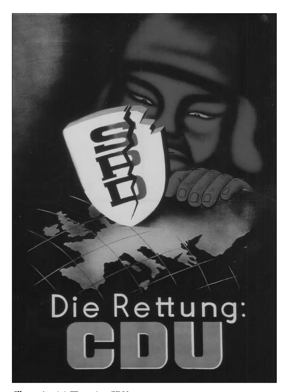
Illustration 2.3 The savior: CDU

The CDU/CSU message was reinforced by another important form of propaganda for the campaign: the Flugblätter (political leaflets). These were distributed in copious quantities in the days leading up to the 14 August election by the central, regional, and district party organizations, although those leaflets developed by the regional or district organizations usually dealt with local issues or incor-