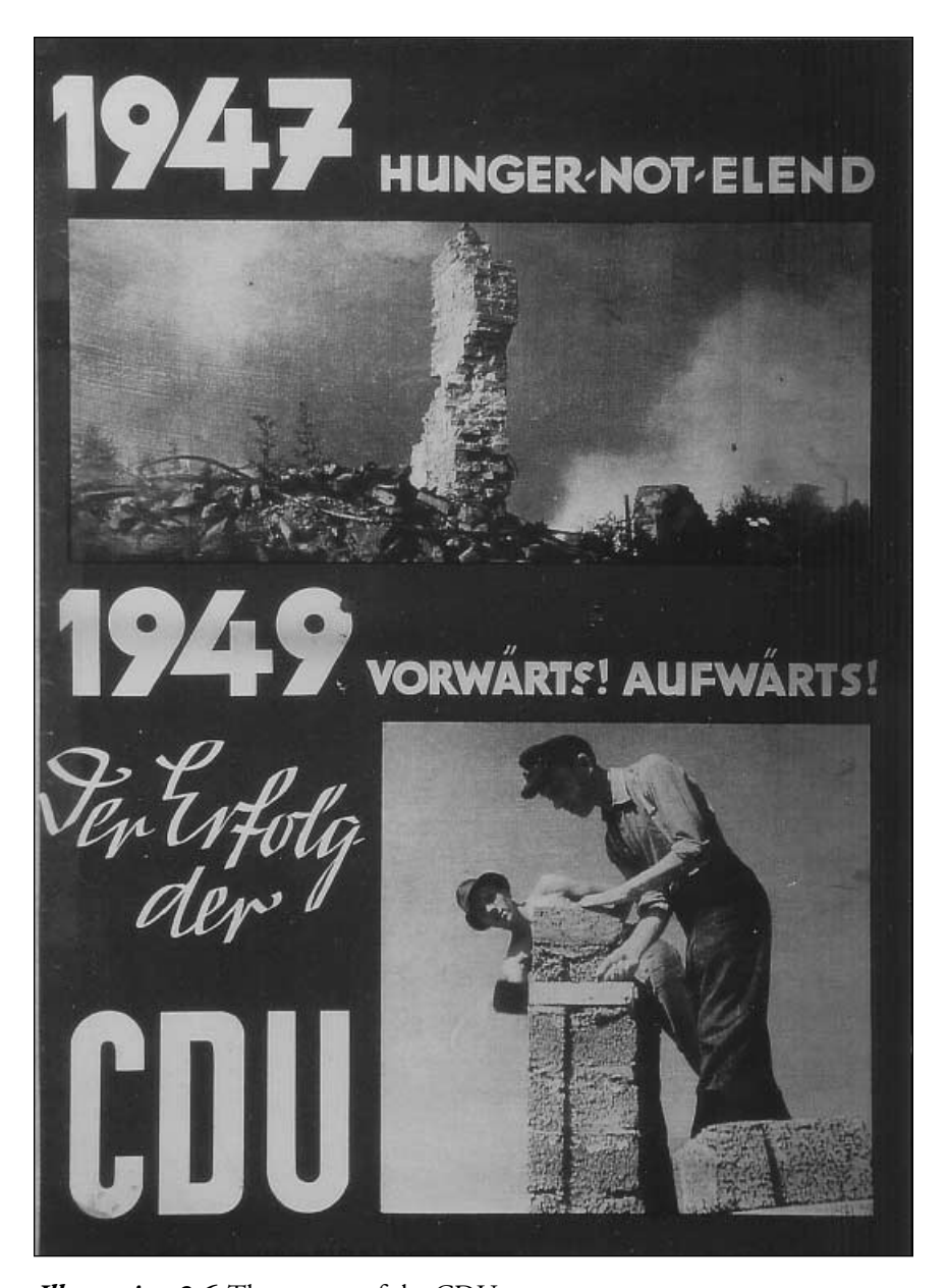
Illustration 2.6 The success of the CDU

was much like that of conser vative parties from Weimar, when, as K oonz and Bridenthal contended, "[w]omen voters were regarded much as American politicians might view the 'ethnic vote.' Their ballots were sought, but too large a participation in party leadership was not encouraged."83 For the most part, this was the case with the CDU/CSU in the early postwar years.84