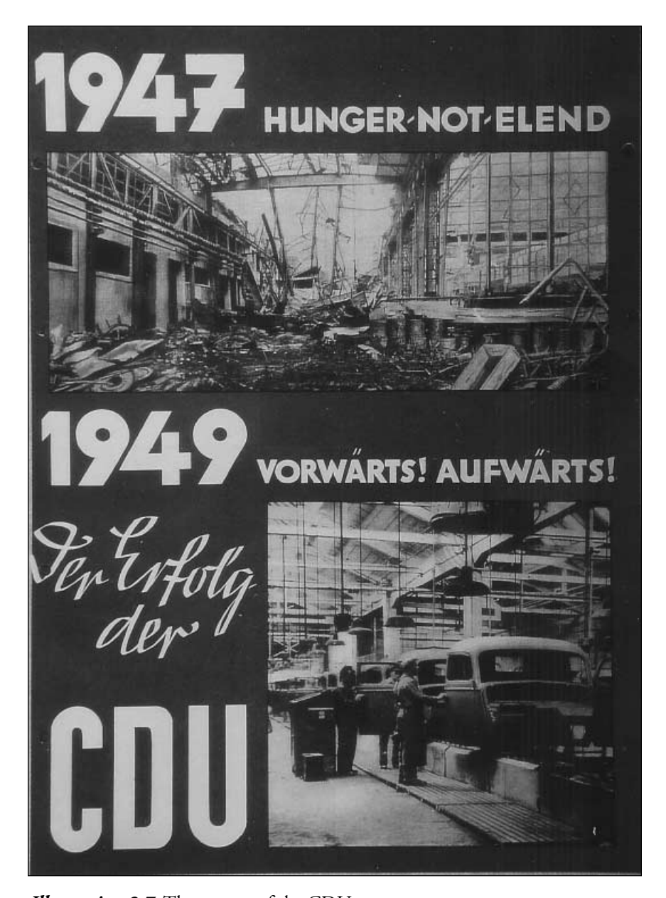
Illustration 2.7 The success of the CDU

What is striking about the pr opaganda produced by the national-lev el CDU/CSU organization is that most of it did not, in general, deal head on with the Christian concerns of the par ty. Only one of the Arbeitsgemeinschaft supplied leaflets touched upon such a concern. The Rhineland CDU, which was battling the Center Party for votes, complained that none of the posters dev el-