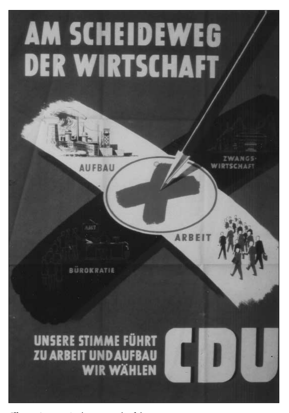
Illustration 2.1 At the crossroads of the economy