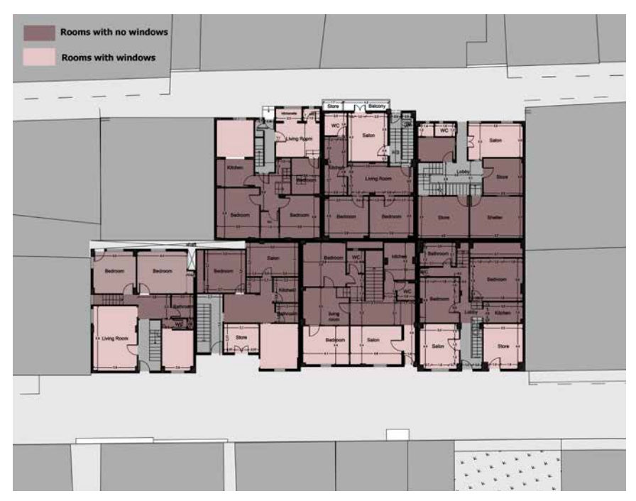
Figure 5.2. Interior architectural layout of Beddawi homes.

tended to the edges of their plots. As all their neighbours did the same, most of the newly built rooms would lack windows or only leave a meagre 30 cm space between the buildings. The new rooms were devoid of natural light and ventilation, and when more floors were added this problem became even worse.<sup>3</sup>