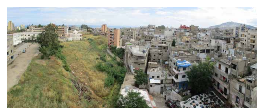
Figure 5.1. Northern border of the Beddawi refugee camp.

However, the limits of area-based approaches arise when communities suffer from structural and legal discrimination (Tosics 2009) at a national level. In such conditions, even the comprehensive and integrated approaches of ABAs will struggle to address the systematic inequalities that have been constructed and maintained over decades within such populations. These can only be addressed by changing national policies and discriminatory laws to finally impact the root causes of the plight within communities. These are similar conditions to camp-based Palestinians in Lebanon, who suffer from discriminatory policies and laws and are denied the right to work and to own property (Hajj 2016).